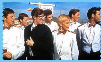
WONDERFUL LIFE | SIDNEY J. FURIE, 1964