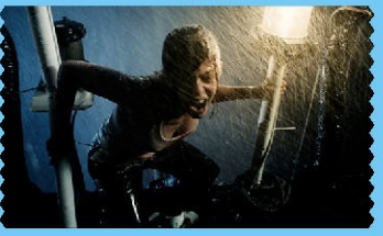
REC 4: APOCALYPSE | JAUME BALAGUERO, 2014

A box-office hit nominated to 16 Goya Awards. It is a thriller about drug trafficking in the Strait of Gibraltar. Starring Luis Tosar, Eduard Fernández and Bárbara Lennie, it made actor Jesús Castro known.