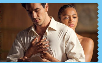
PALM TREES IN THE SNOW | FERNANDO GONZÁLEZ MOLINA, 2015