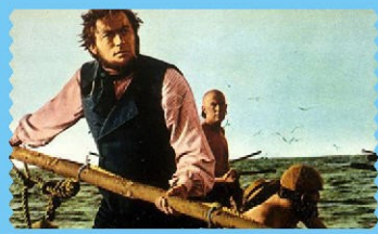
MOBY DICK | JOHN HUSTON, 1956

Hollywood adapted Herman Melville's literary classic, with a script by Ray Bradbury and John Huston, and starring Gregory Peck as Captain Ahab. It was the biggest box-office draw in the USA. It is considered one of the best hundred movies in film history.