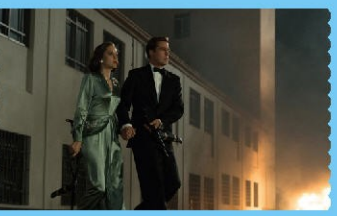
ALLIED | ROBERT ZEMECKIS, 2016

A thriller about a bank robbery starring Raúl Arevalo, José Coronado and Raúl de la Serna. One of 2016's biggest box-offices draws. Las Palmas became the Spanish city of Valencia.